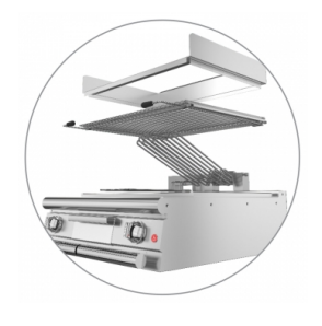
Electric version with overturning resistances to facilitate the cleaning process