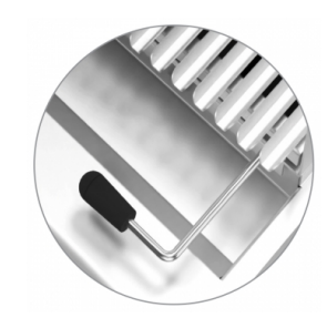
Grilled height adjustment for the management of different types of cooking