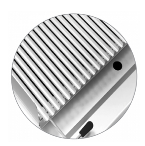
Larger and wider fat channel