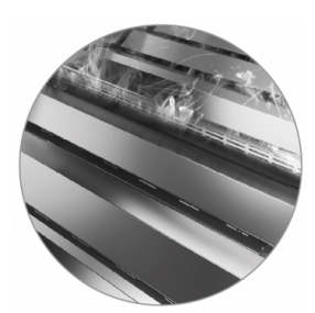
Smoking that can be installed on the M80 - M120 models for a barbecue taste menu