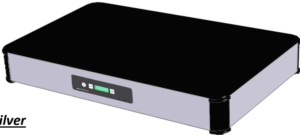
Black - Silver