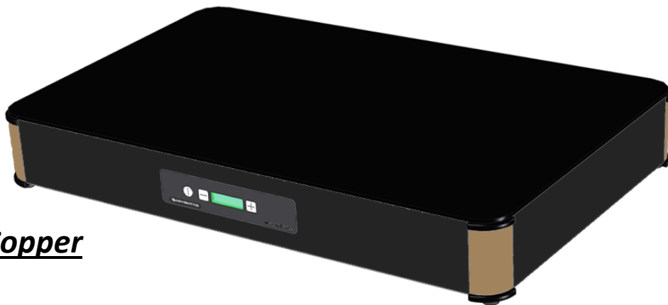
Black - Copper

ADVENTYS Route de Pagny - 21250 Seurre - France www.adventys.com contact@adventys.com T: 03.80.20.46.15