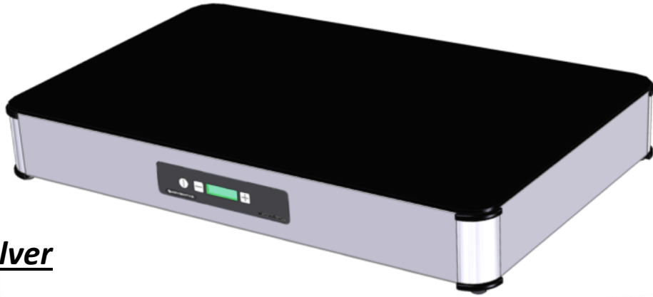
Silver - Silver