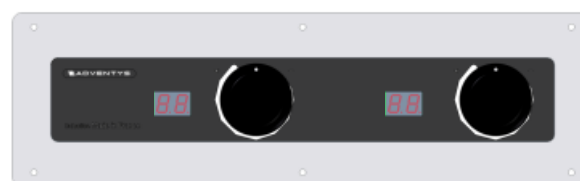
Cutout dimensions for built-in controls: 392x80mm

ADVENTYS Route de Pagny - 21250 Seurre - France www.adventys.com sales@adventys.com T: +33 3 80 20 46 15