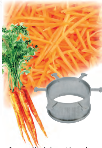
Raw vegetable cylinders, stainless steel, sharpened separately