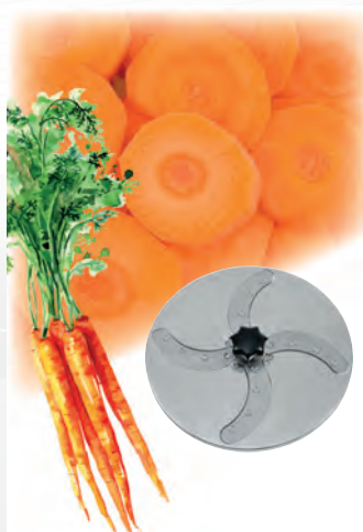
Curved blade disc, stainless steel, adjustable 0 - 10 mm 145 020 000