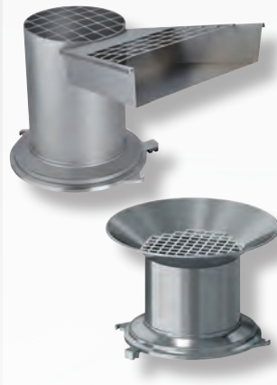
Universal hopper with feeding chute, stainless steel, with safety switch-off 145 013 000