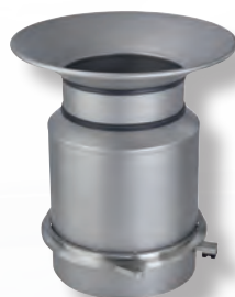
Cutting hopper, stainless steel specifically for cabbage- and cutting slices 145 034 000