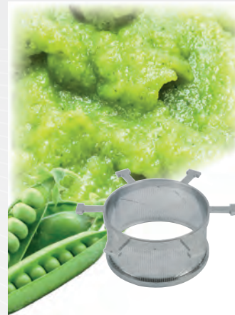
Pureeing cylinder, stainless steel 548 100 9440