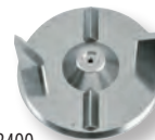
two wings 548 000 3400