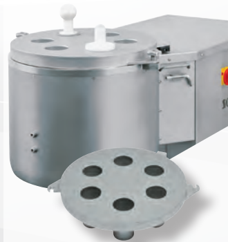
Tube hopper for a guided slice cut