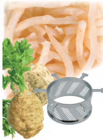
Shredding cylinders, stainless steel, sharpened separately

Shredding of e.g. carrots, radishes, celery