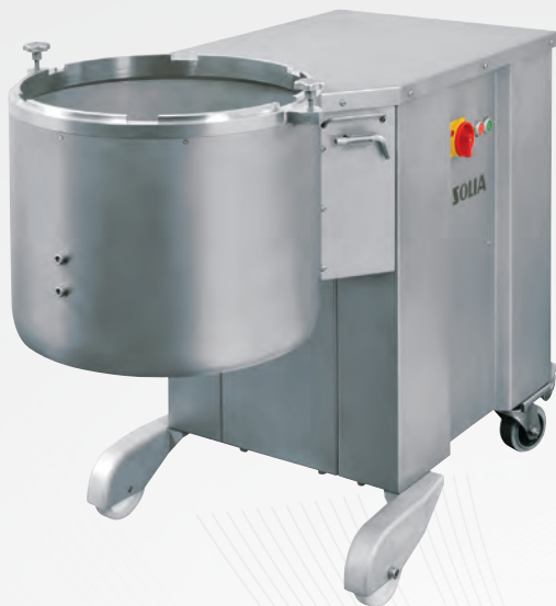
G 450 Universal vegetable cutter

The figures shown here are for illustration only and may deviate from the actual design version. Technical alterations are reserved. or additional accessories please refer to our price list.