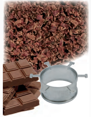
Grating cylinders, stainless steel

Shredding of e.g. carrots, radishes, celery