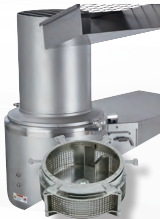
Dicing in high capacity