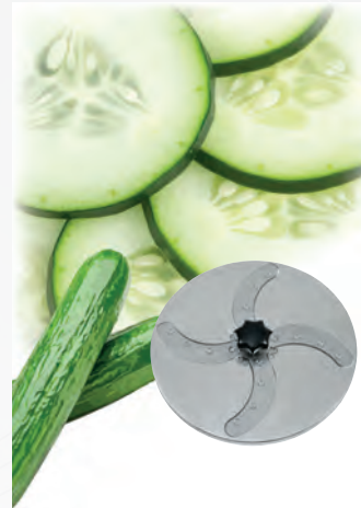
Curved blade disc, stainless steel, adjustable 0 - 10 mm 145 020 000