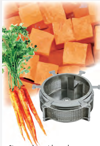
Dicers complete, stainless steel 6 mm 548 200 5200 8 mm 548 200 5300 11 mm 548 200 5400 16 mm 548 200 5500 22 mm 548 200 5600