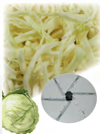
Cabbage cutting discs, stainless steel 1,3 mm 145 023 000 2,5 mm 145 024 000