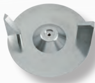
Dicing wing, stainless steel 145 043 000