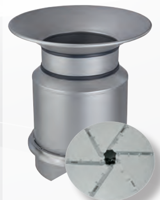
Innovative cutting hopper for cabbage