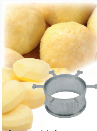
Potato grating cylinder, 2 mm, crown toothing, stainless steel 2 mm 145 071 330

Grating of e.g. hard bread, boiled potatoes, almonds, nuts, chocolate