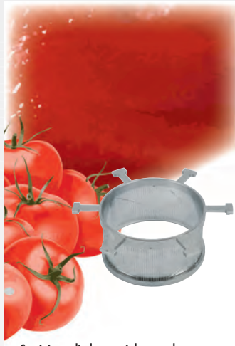
Straining cylinders, stainless steel 1,5 mm 548 100 3410 3 mm 548 100 3430