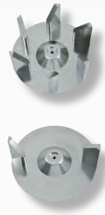
Standard wing, stainless steel six-wings 548 000 9305