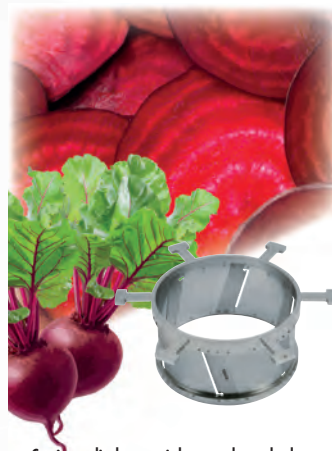
Cutting cylinders, stainless steel, toothed, 6 pieces