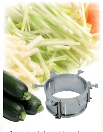
Strip cutting cylinders, stainless steel

Slicing of e.g. potatoes, celery, beetroots, carrots