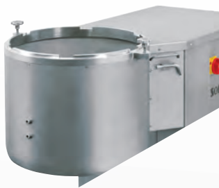
Numerous application options :