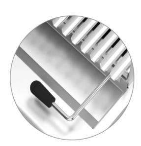
Grilled height adjustment for the management of different types of cooking