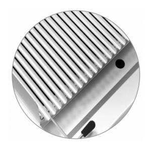
Larger and wider fat channel