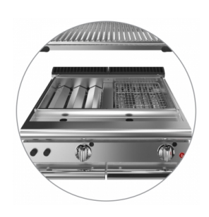
Type of type of cooking also in user gas / lava stone grid, with dedicated accessories