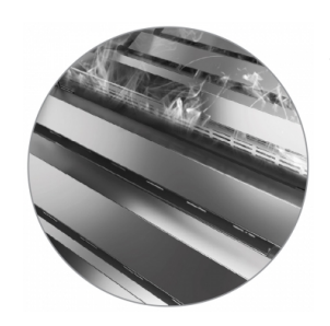
Smoking that can be installed on the M80 - M120 models for a barbecue taste menu