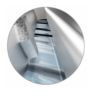
Disponibile come accessorio il kit erogatore acqua