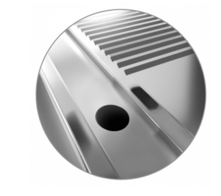
The design of the striped plate guarantees cleaning until the end of the plate

Alarmable gully for the collection of cooking residues on the entire perimeter of the facilitated cleaning plate, and better maintenance of the humidity of the food in cooking