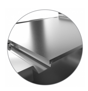
Plate not welded to the machine with optimization of the structural points subjected to thermal stress