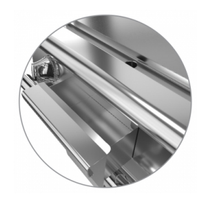
Large fatty drawer with capacity of the entire volume of the perimeter channel

Alarmable gully for the collection of cooking residues on the entire perimeter of the facilitated cleaning plate, and better maintenance of the humidity of the food in cooking