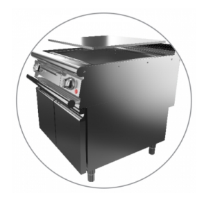
Plate not welded to speed up maintenance interventions and any replacements in users

Uniform cooking temperature on the whole plate. Optimizing the heat in the coach area and increasing the comfort of operators in the kitchen.