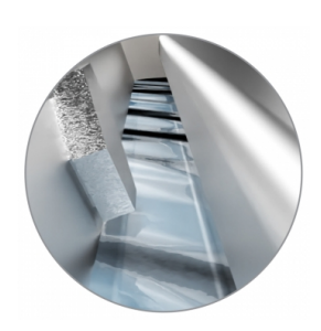
Disponibile come accessorio il kit erogatore acqua