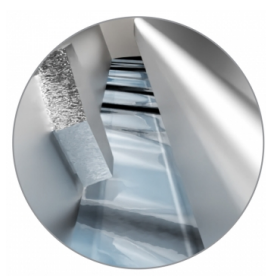
Disponibile come accessorio il kit erogatore acqua