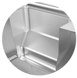
Tank depth and width increased to increase capacity.