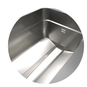
In the gas version, the molded inner tank is clean with external burners for easy cleaning.

Heating element completely removable from the tank to allow faster and more complete cleaning. In 10- and 15-liter versions