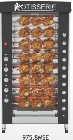
Stainless steel with black enamel and chrome