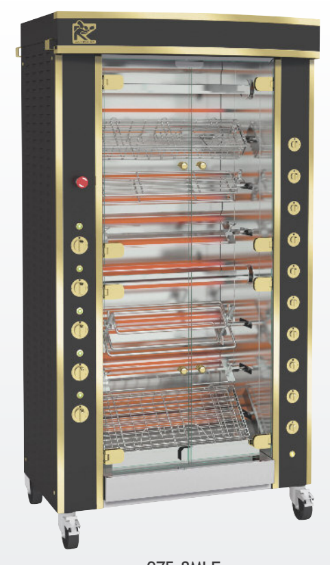
975.8MLE Black enamel and brass