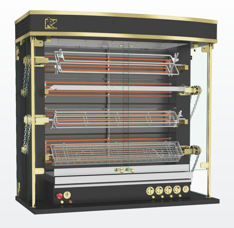
1375.40LE Black enamel and brass