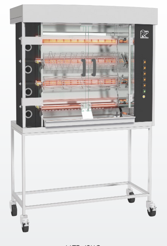
1175.4SMG Black front panels <u>and stainless steel finish</u>