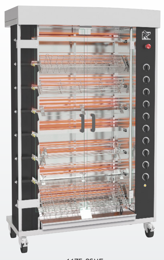
1175.8SME Black front panels and stainless steel finish