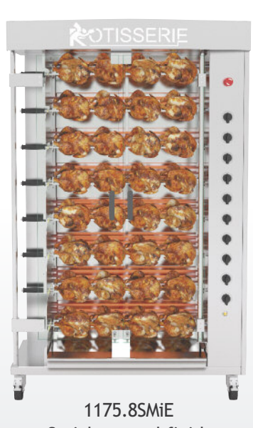
Stainless steel finish