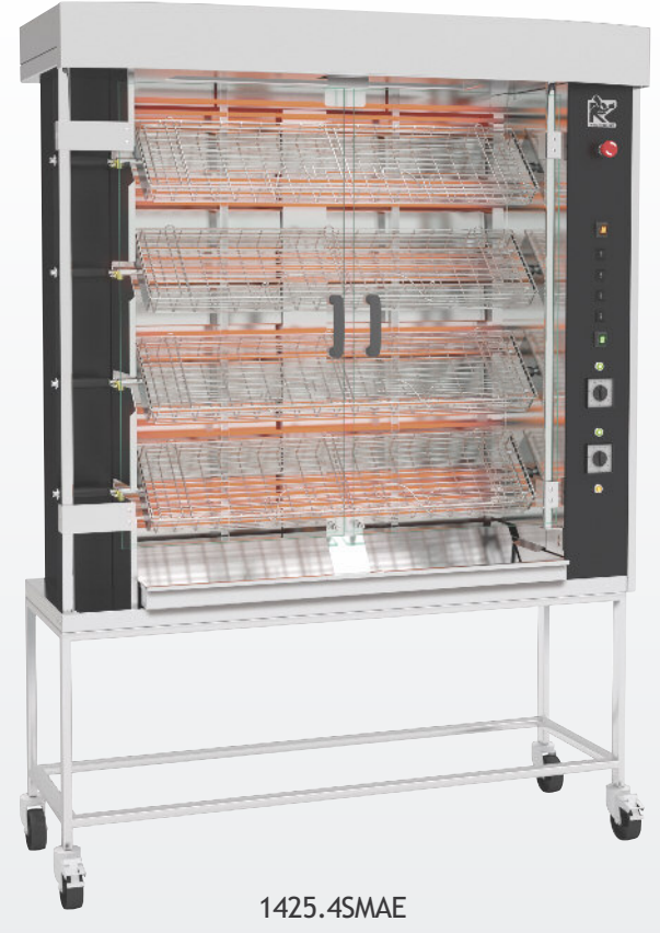
Black front panels and stainless steel finish

Overview of some of the standard features.