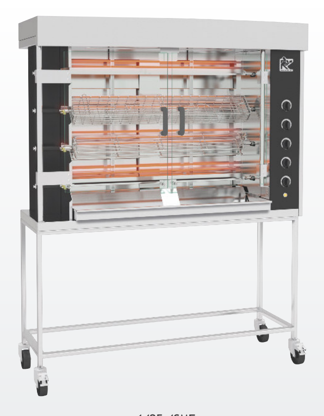
1425.4SME Black front panels and stainless steel finish