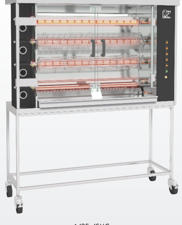
1425.4SMG Black front panels <u>and stainless steel finish</u>