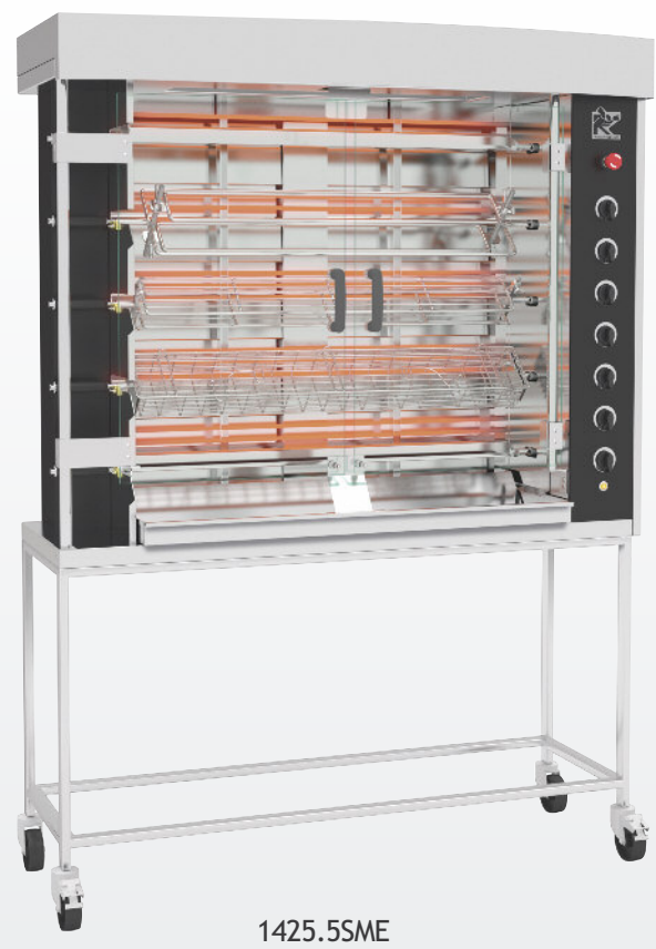
Black front panels and stainless steel finish