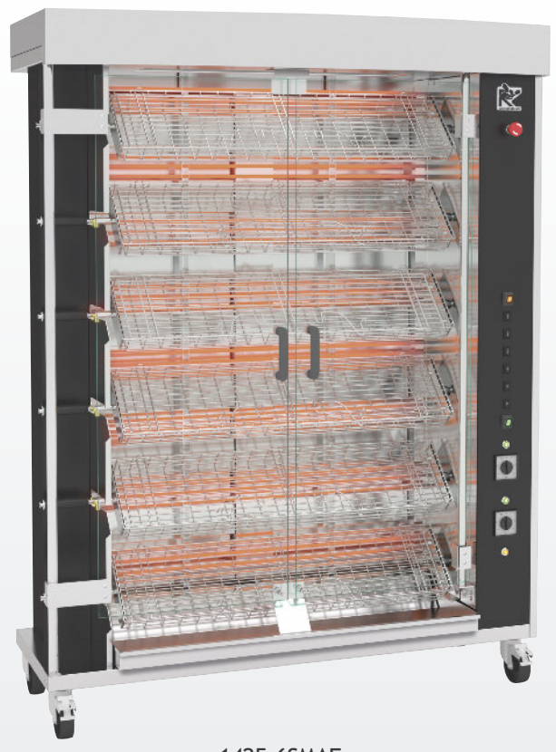
1425.6SMAE Black front panels and stainless steel finish