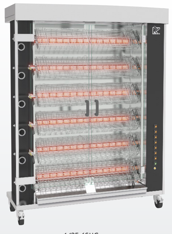
1425.6SMG Black front panels <u>and stainless</u> steel finish