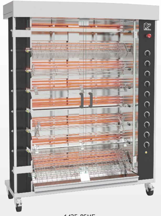
1425.8SME Black front panels and stainless steel finish