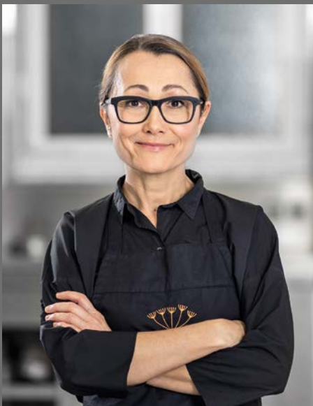
"... cooks gently and safely, maximizes the quality of the dishes!" Tanja Grandits, 19 Gault Millau points, Chef of the year 2020, 2 Michelin Star Chef