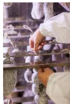
Placement of salami inside KLIMA AGING SYSTEM