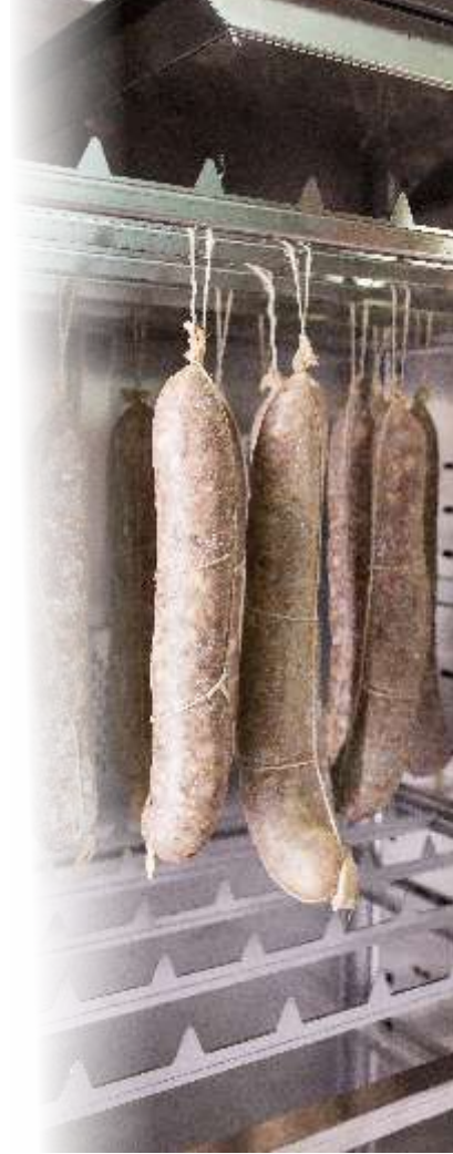
Salami during the first step of the aging process KLIMA FOOD CONTROL SYSTEM