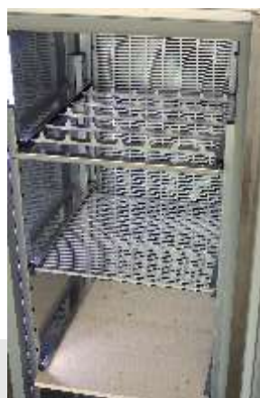
Patented frame for hanging salami, grill, evaporated wood plank