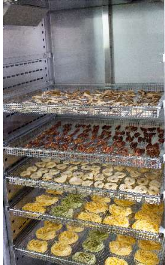
Products dried with KLIMA FOOD CONTROL SYSTEM