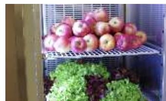
Fruit and vegetable preservation KLIMA STORAGE