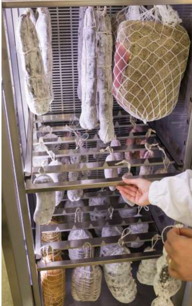
Aged salami and other aged cold cuts KLIMA FOOD CONTROL SYSTEM