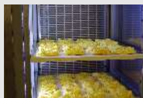
Pasta preservation KLIMA STORAGE