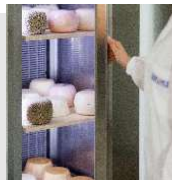
Preserved cheese, KLIMA STORAGE with stainless steel door