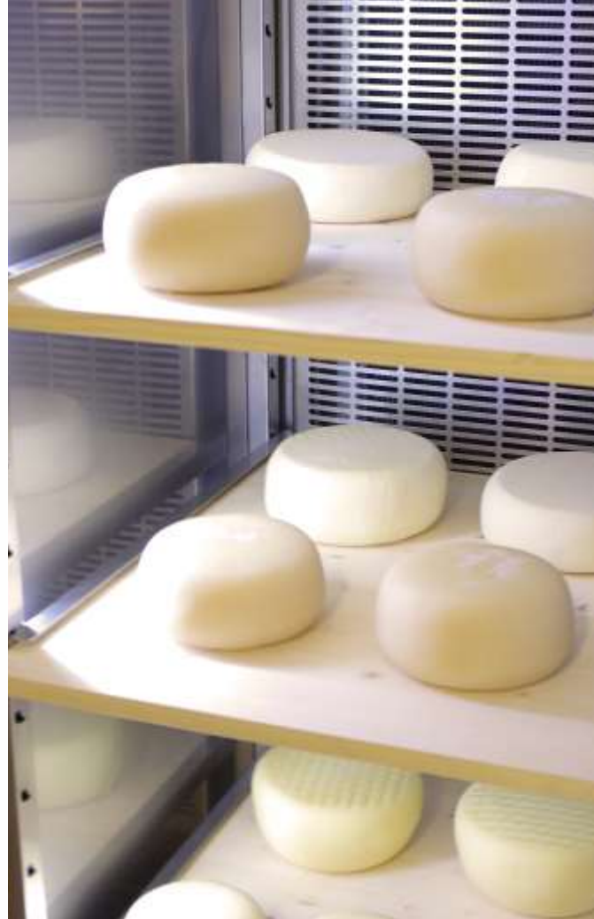
Aged cheese KLIMA FOOD CONTROL SYSTEM