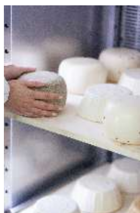
Cheese ripening inside KLIMA AGING SYSTEM

Salami without additives: thanks to the specific drying process, the exact adjustment of humidity and temperature, you shall have a «natural» maturation. Moreover, you can avoid the use of additives , keeping the complete control on the bacterial activity.