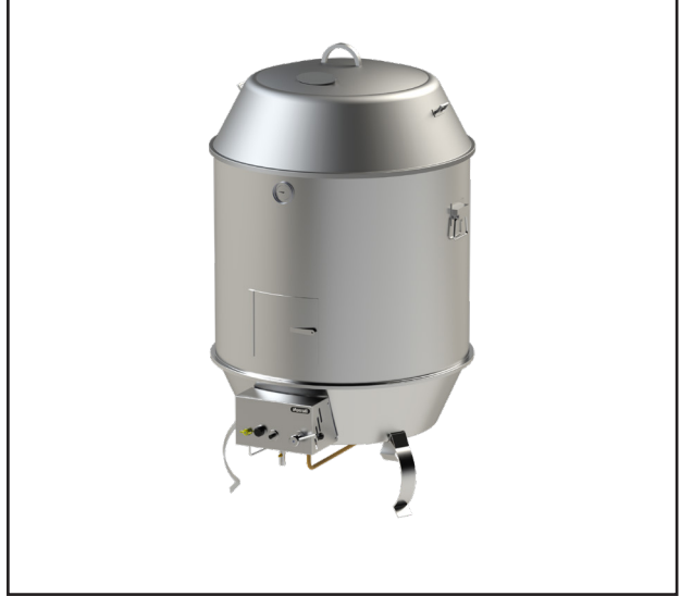
Due to continuous technical development, the image shown may not represent the latest design of the unit.

Asian Cooking - Roaster & Grill Gas - Duck Roaster NGDR 900