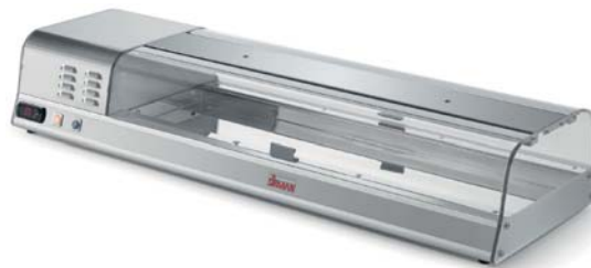
VISTA EASYCOLD 130