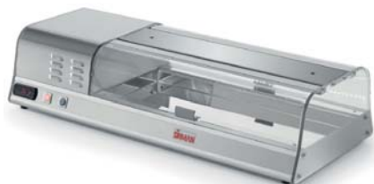
VISTA EASYCOLD 100